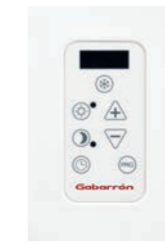
PH Plus Control Panel